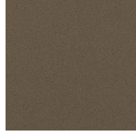
Ancient Bronze - 28 (ABZ)