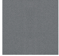
Fade to Gray - 12 (FTG)