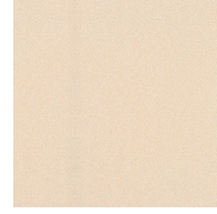
Hampton Bay - 05 (HAB)