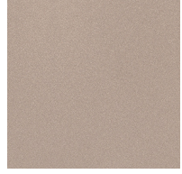
Lagoon - 06 (LAG)