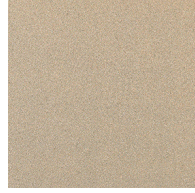
Champagne Cream - 26 (CHC)